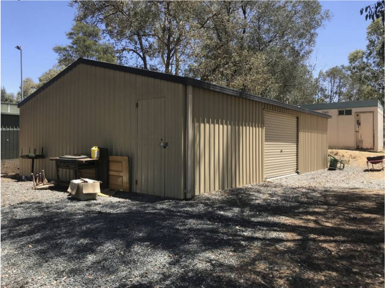
The old Weston Creek Men's Shed in Kambah.

Prior to the move, the men of Weston Creek were located out at Kambah in a tin shed on the grounds of the Eternity Church.